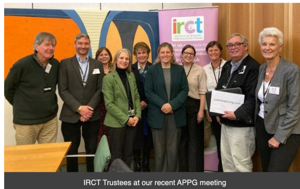
IRCT Trustees at our recent APPG meeting